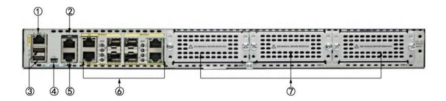
Figure 3 shows the back panel of Cisco ISR4431/K9.